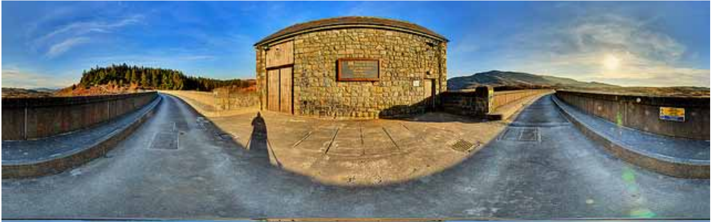
The Maentwrog Dam

The vast boggy floodplain created by the Afon (river) Prysor as it meandered along the foot of the Rhinogydd mountain range, acted like a sponge capturing gallons of water from the surrounding hills which then seeped away northwards into the Vale of Ffestiniog. This water was a valuable source of energy that could drive a hydro-electric power station at Maentwrog in the next valley to the north.