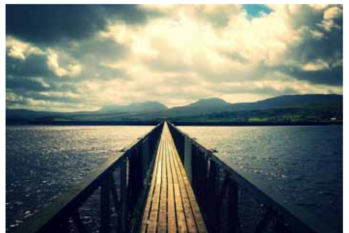
Footbridge across the lake

Today this drowned valley is making the most of its main assets – the lake and deep cultural roots (or 'rich heritage')- and aiming to attract visitors to its café fishery and many heritage sites. A cycle path and walking route hugs the shores of the lake from which the surrounding hills can be viewed and the name Trawsfynydd, which means 'amid mountains' can be truly appreciated!